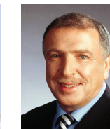
Ilya Klebanov Plenipotentiary Representative of the President of the RF in the North- Western Federal District