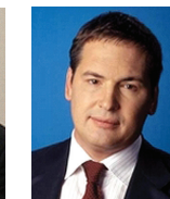
Vitaly Yuzhilin Member of the State Duma; Chairman of the Executive Board, Association of Sea and Trade Ports