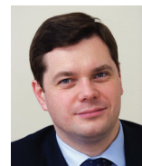
Aleksey Mordashov CEO, OAO Severstal; Co-chairman of the Northern Dimension Business Council