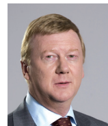
Anatoliy Chubays CEO of the RUSNANO; Co- chairman EU - Rus- sia Industrialists' Round Table