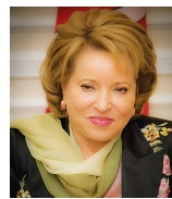
Valentina Matvienko Governor of St. Petersburg