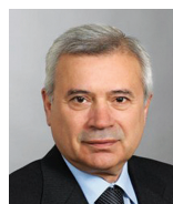
Vagit Alekperov President, OAO Lukoil