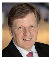
Esko Aho Executive Vice President, Corporate Relations and Responsibility, Nokia